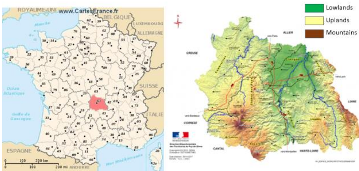
Figure 3: Location and physical map of the case study area of Puy-de-Dôme (France)